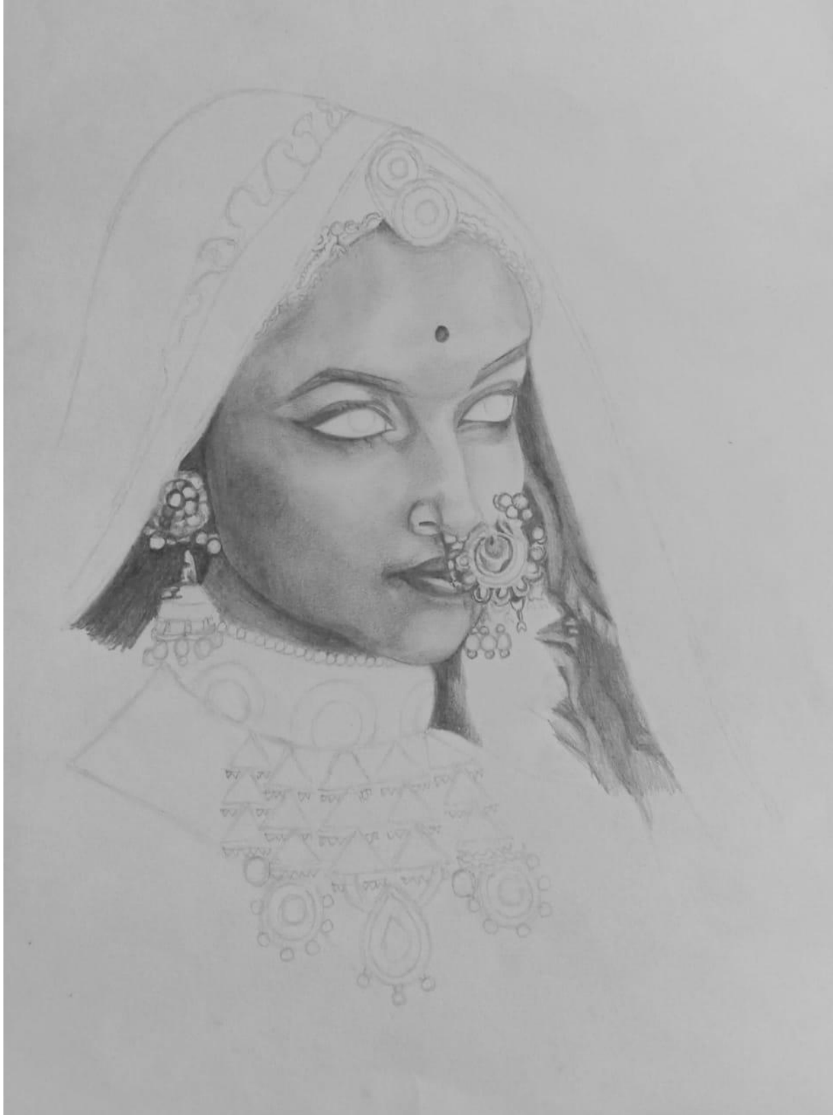
Title: Rani Padmavati (Indian Queen) [Work in progress], 2020 Medium: Pencil, eraser (no usage of white charcoal)