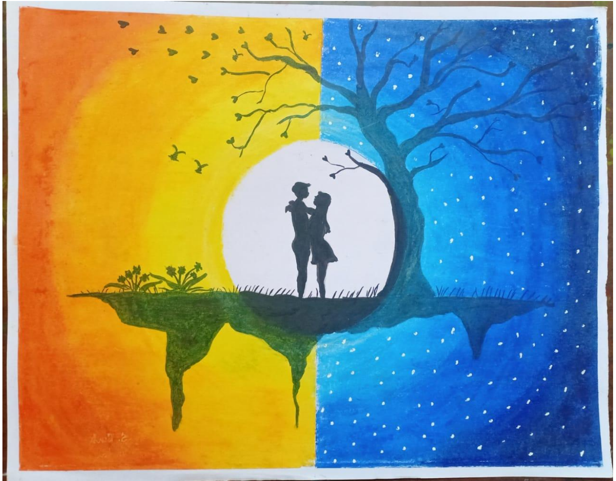
Title: Dawn and Dusk, 2019

Medium: Oil pastel, Black Brush Pen, Correction Pen (Whitener)