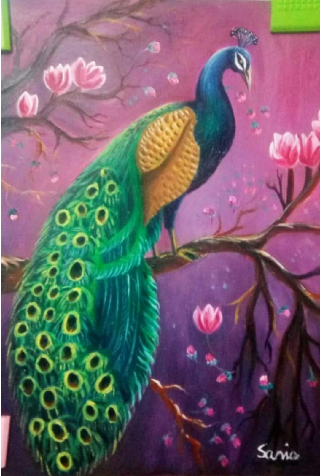
Title: Peacock (National bird of India), 2018 Medium: Oil Painting